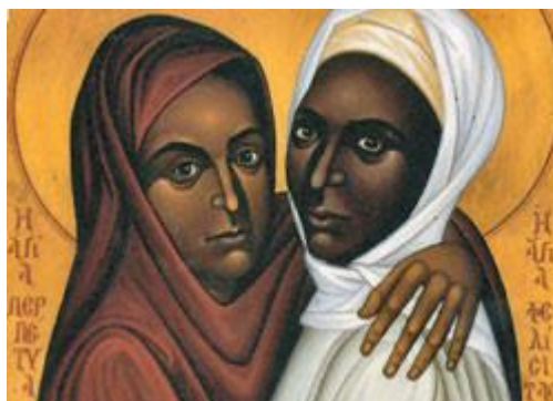
Saints Perpetua & Felicity

Saint of the Week Wednesday 7 th March was the Feast Day of Saints Perpetua and Felicity of Carthage. They were members of a group martyred for being a Christian during the reign of the Roman Emperor Septimus Severus. Perpetua was put to death, with her companions, during games that were being held to mark the Emperor's birthday. Perpetua refused to deny her beliefs, despite pleading from her own father. Perpetua is the patron saint of mothers and expectant mothers and it is fitting that we remember her at this point in the year—yesterday was International Women's Day and Sunday will be Mothering Sunday (Mother's Day).