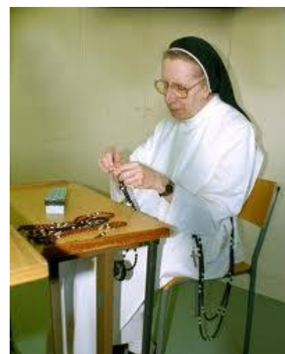
A Nun Making Rosaries

Attendance Nursery class 100% RF 95.9% 1F 95.2% 2T 98.8% 3W 98.3% 4H 95.7% 5B 96.3% 6L 98.4% Well done to the Nursery class for perfect attendance last week. Overall, so far this term, attendance has been at a three year high of 97.5%--let's hope we can maintain this across the whole school year.