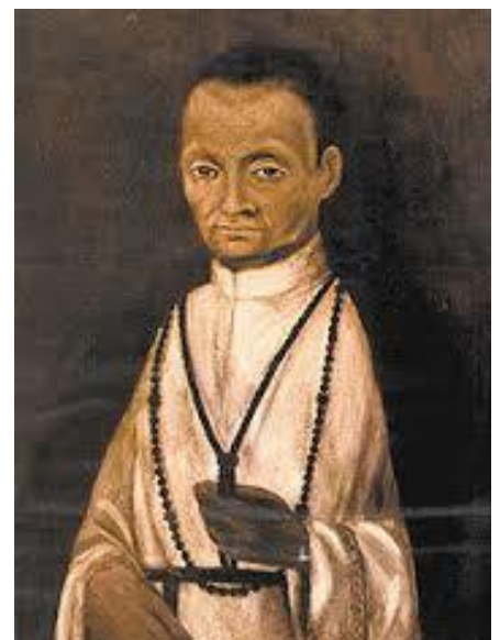
St Martin de Porres

Prayer to the Holy Family Jesus, Mary and Joseph, in you we contemplate the splendour of true love; to you we turn with trust. Holy Family of Nazareth, grant that our families too may be places of communion and prayer, authentic schools of the Gospel and small domestic churches. Holy Family of Nazareth, may families never again experience violence, rejection and division; may all who have been hurt or scandalized find ready comfort and healing. Holy Family of