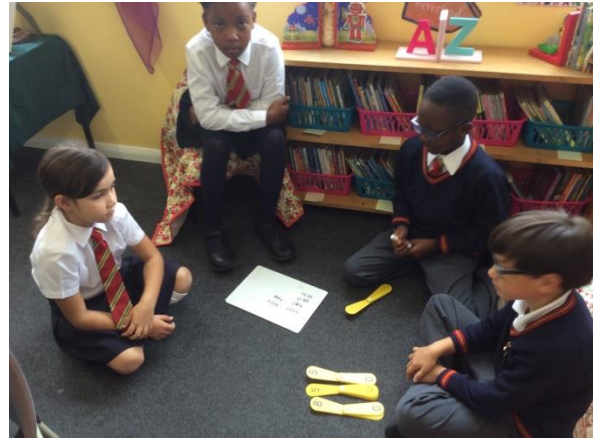
Maths in Year 4