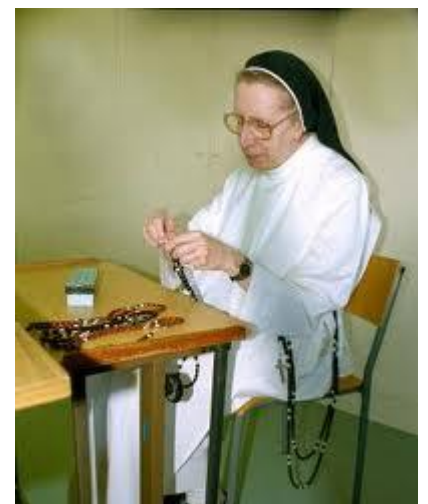
A Nun Making Rosaries