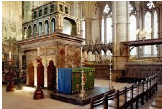
Shrine of St Edward the Confessor, Westminster Abbey