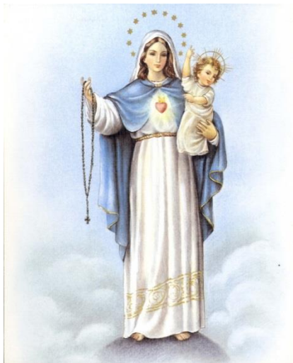
Our Lady of the Rosary

Please take time to pray the Rosary with your children throughout October. I know many children receive Rosary beads as gifts, especially around the time of their Baptism or First Holy Communion—October is an ideal time for your children to use their Rosary.