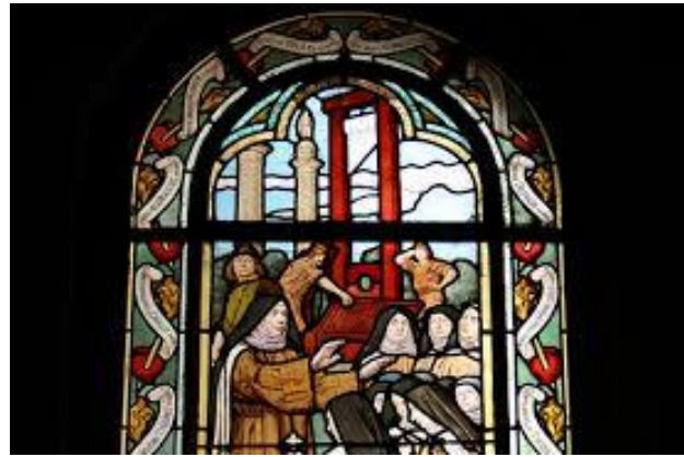
Stained glass window, Saint-Honoré d'Eylau, Paris