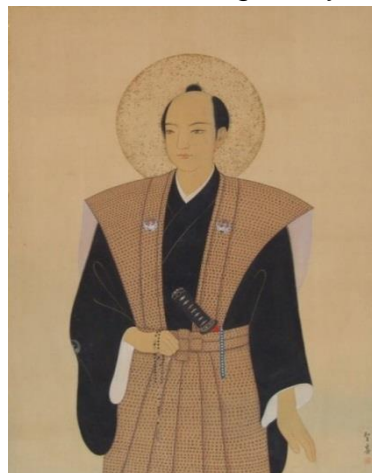
St Paul Miki